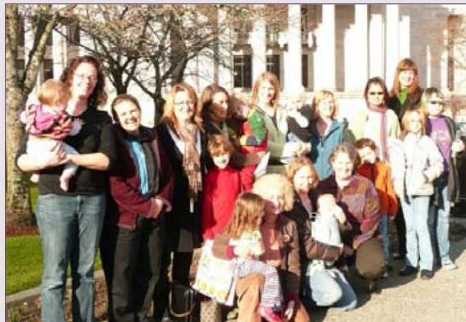
Supporters of HB 1596 gather at the Capitol after the House Committee on State Government & Tribal Affairs heard testimony.

Despite expectation of a small number of complaints, lawmakers said past instances of discrimination make the proposed law necessary. The majority of other states have laws protecting a mother’s right to breastfeed in public. “We think this is a great idea. We want to protect the rights of